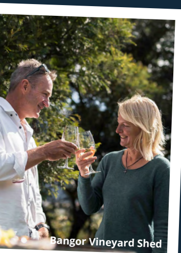
Bangor Vineyard Shed