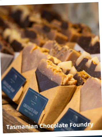
Tasmanian Chocolate Foundry