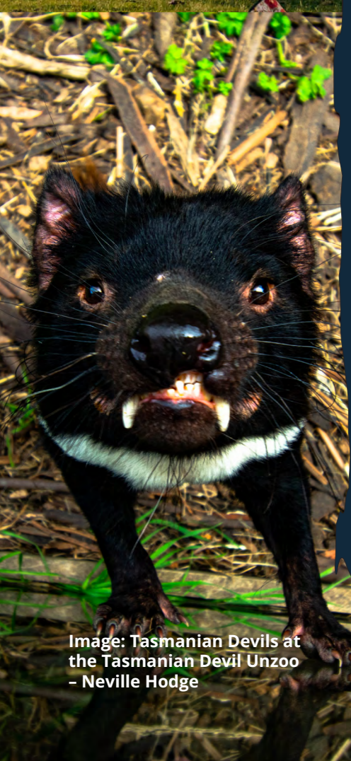
Image: Tasmanian Devils at the Tasmanian Devil Unzoo - Neville Hodge