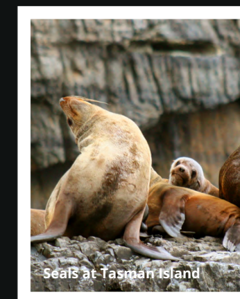
Seals at Tasman Island