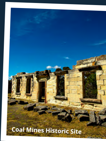
Coal Mines Historic Site