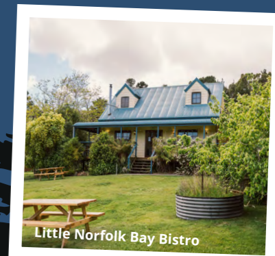
Little Norfolk Bay Bistro