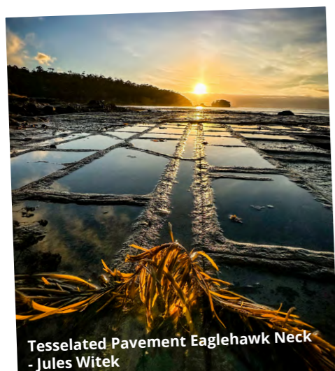
Tessellated Pavement Eaglehawk Neck - Jules Witek

You've probably heard of Port Arthur Historic Site—it's hard not to when talking about Tasmania. But this town is more than a historical footnote. It's layered with beauty and resilience, presenting experiences that speak to the soul. Whether you're a history buff, nature lover or just someone in need of a real escape, Port Arthur has a way of drawing you in, making you feel like you've discovered something truly special.