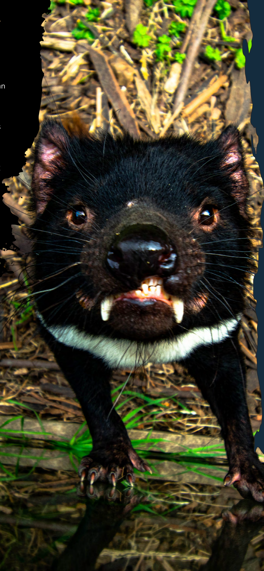
Image right: Tasmanian Devils at the Tasmanian Devil Unzoo

Now, let's talk about devils—Tasmanian devils, that is. I stopped by the Tasmanian Devil Unzoo , a place that redefines the idea of a zoo. Here, wildlife roams more freely, and it feels more like being a guest in their home than a visitor at an exhibit. Watching Tasmanian devils during feeding time was a real highlight, and hand-feeding a parrot at the Birds of the Bush presentation was a fun surprise!