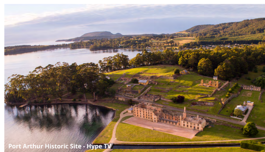
Port Arthur Historic Site - Hype TV